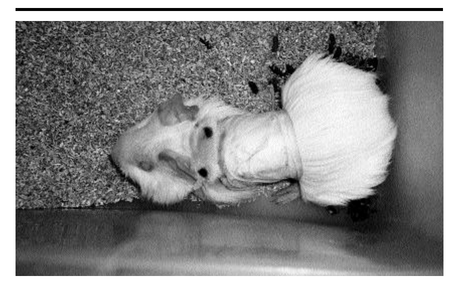
Fig. 3: Guinea pig used in phototoxicity testing at a French contract laboratory in 2000.

In 1997, after seven years of validation, the cell culture test for the determination of phototoxic effects was declared successfully validated by the ECVAM Scientific Advisory Committee. Afterward it took three more years, until, in June 2000, the method was published (2000/33/EEC) in Annex V of the Directive on the classification of dangerous substances (67/548/EEC) after which it became legally binding in the European Union. After a further delay, in November 2001, an expert group recommended this test for inclusion into the international OECD (Organization for the Economic Cooperation and Development) Test Guidelines for the Testing of Chemicals. In May 2002 the cell culture test was approved by the OECD.